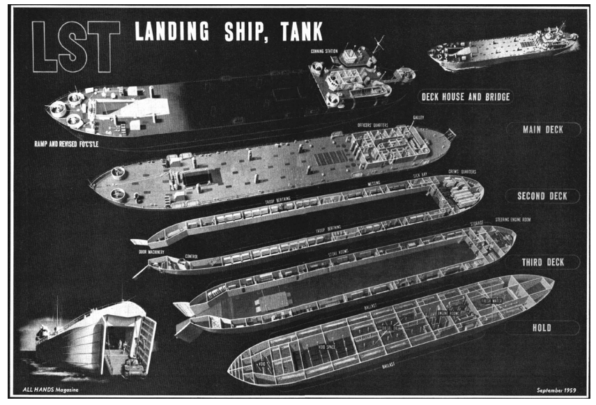
More than 1,000 landing ship, tanks (LSTs) were built for use in World War II. The seagoing vessels traveled around the globe.

your stern anchor out and your bow anchor out," he explained, eyes lighting up. "When the tide goes out, you're left high and dry—without a drop of water beneath the ship. It's all flat-bottom, like a tabletop."