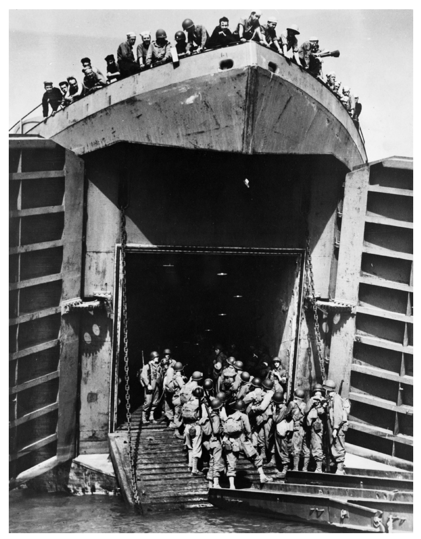
The LST could swing open her enormous bow doors to disgorge Sherman tanks directly onto a sloped beach.

craft directly onto enemy turf. All she needed was a gradually sloped beach. Sometimes, she hauled as many as 15 Sherman tanks and 14 craft in a single crossing. Sailors could wait out the tide and pull the vessel back off the shore. Narozonick became engrossed in the mechanics of the LST. He proudly displayed models of the ship and had a collection of books detailing her crucial role: "You go in late in the afternoon. You get