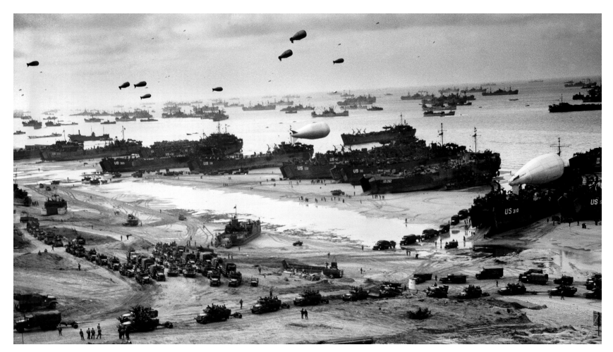
Landing ship, tanks unload vehicles onto Omaha Beach. Of their crucial role in World War II, Winston Churchill once quipped to General Eisenhower: "The destinies of two great empires seemed to be tied up in some goddamn things called LSTs."

It would carry hundreds of thousands of Allies—millions of tons of weapons—across the English Channel and into Fortress Europe.